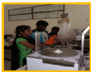
Coca beans grinding